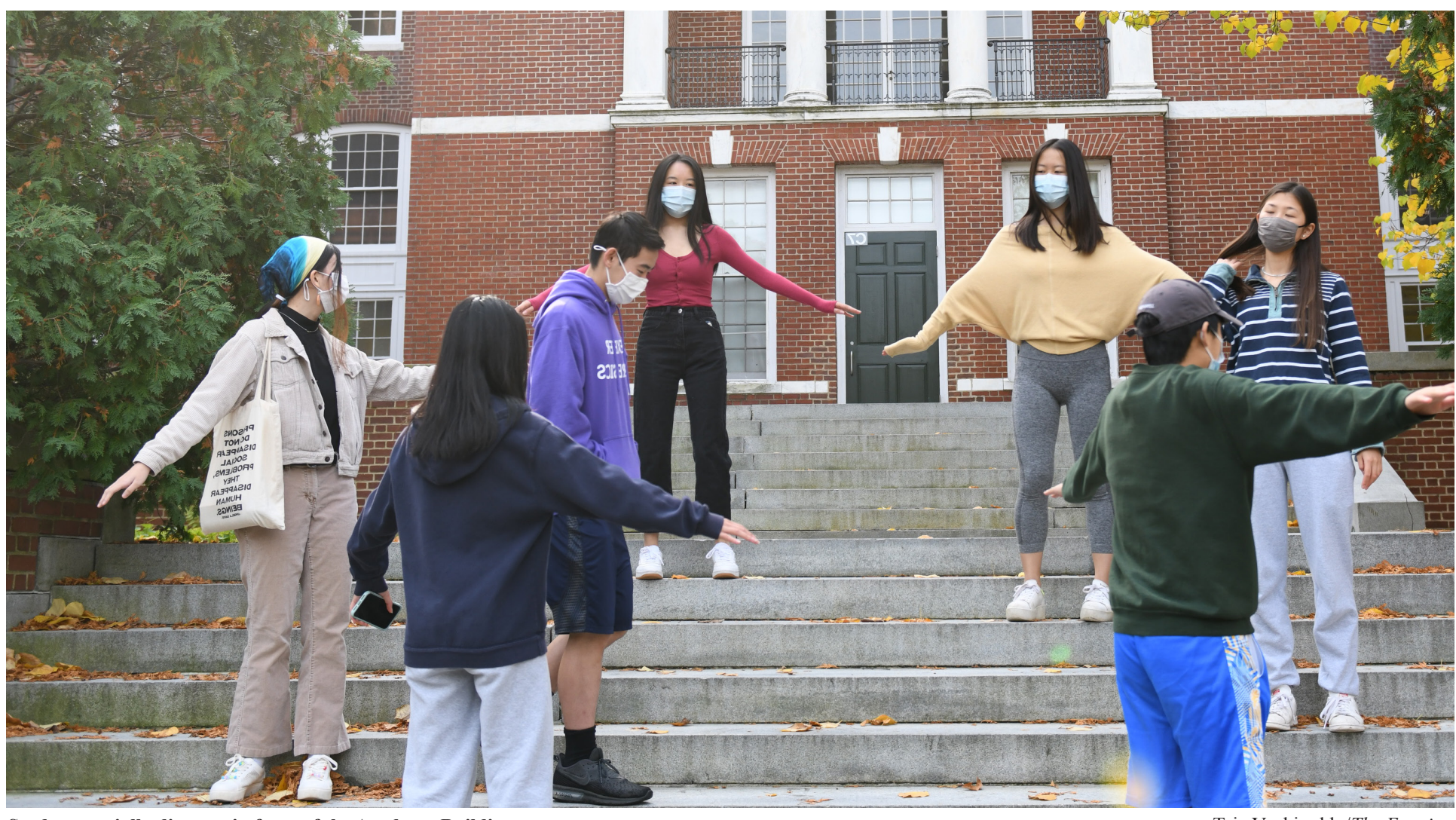
Students socially distance in front of the Academy Building.