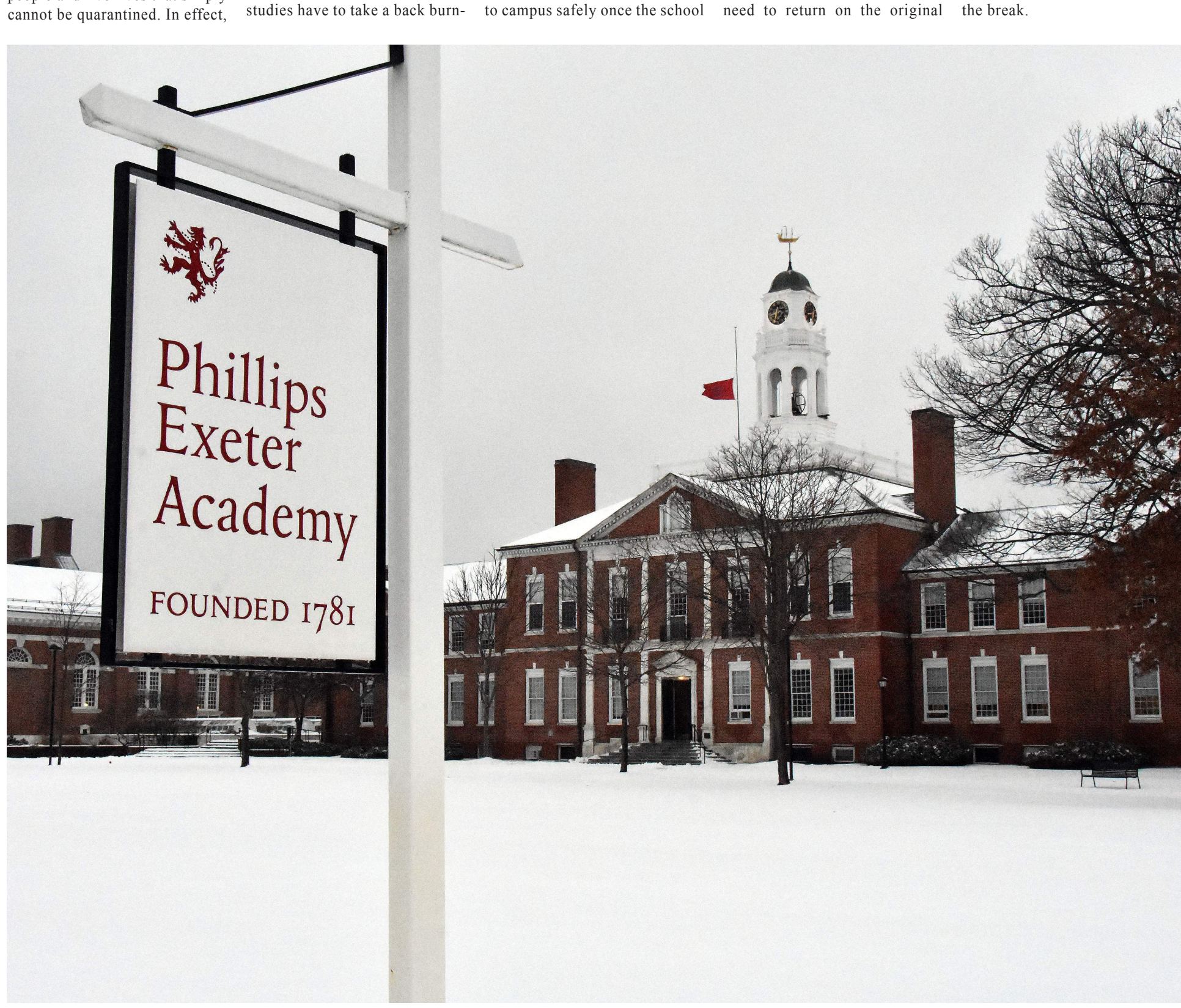
Phillips Exeter Academy in the snow.

Learning from home was catastrophic to the mental health of low-income students and their families. The Academy did what was right in keeping us at home when we had so little information. The entire world needed to halt. This time is different. It is unsustainable to continue to ask students to spend long periods of time schooling (especially graded schooling) at home, where everyone begins with such unequal footing. The plan to return to campus needs to be supportive of youth from every quarter-and must not expect those with less means to "push through it." ALIE urges the school to at the very least provide an option for students to come back to campus in early January or, better yet, stay over the break.