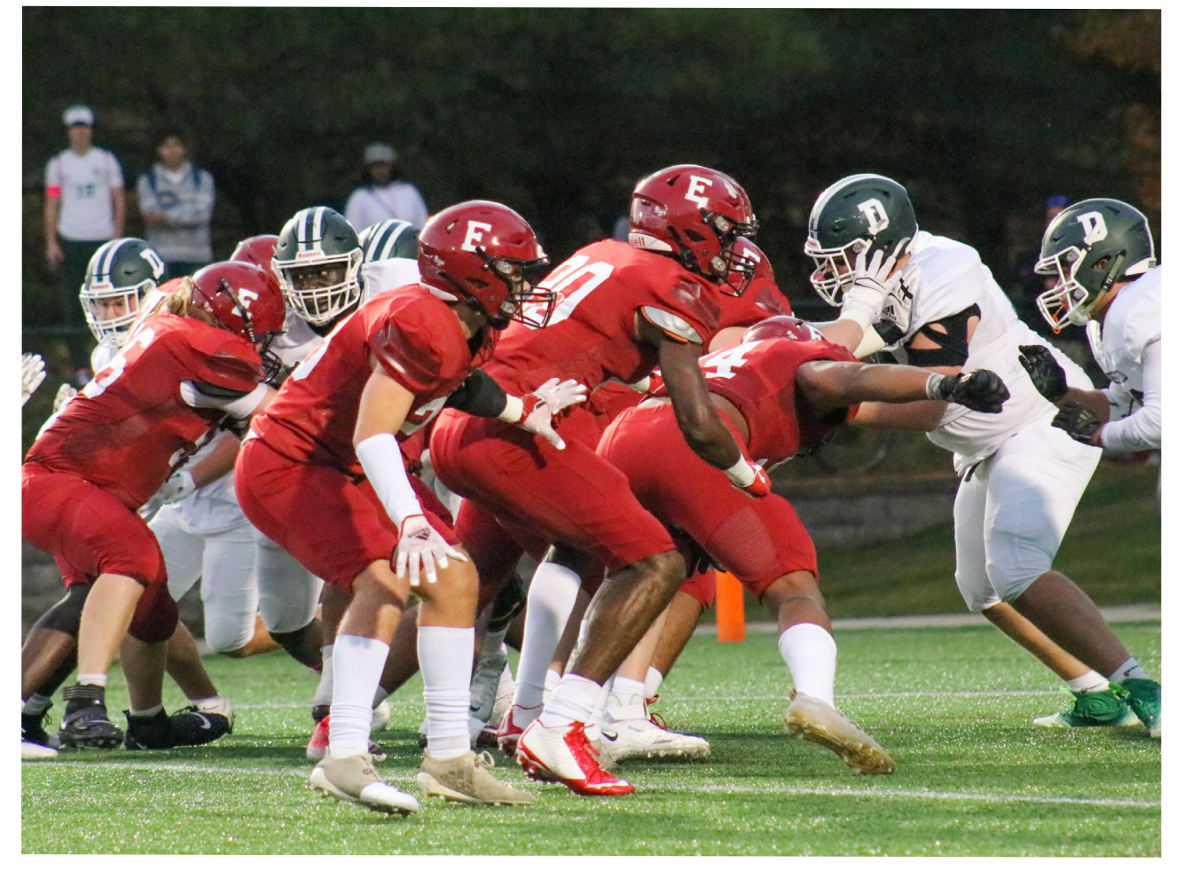
Exeter football goes head to head against Deerfield Academy in their most recent game, winning 36-7.