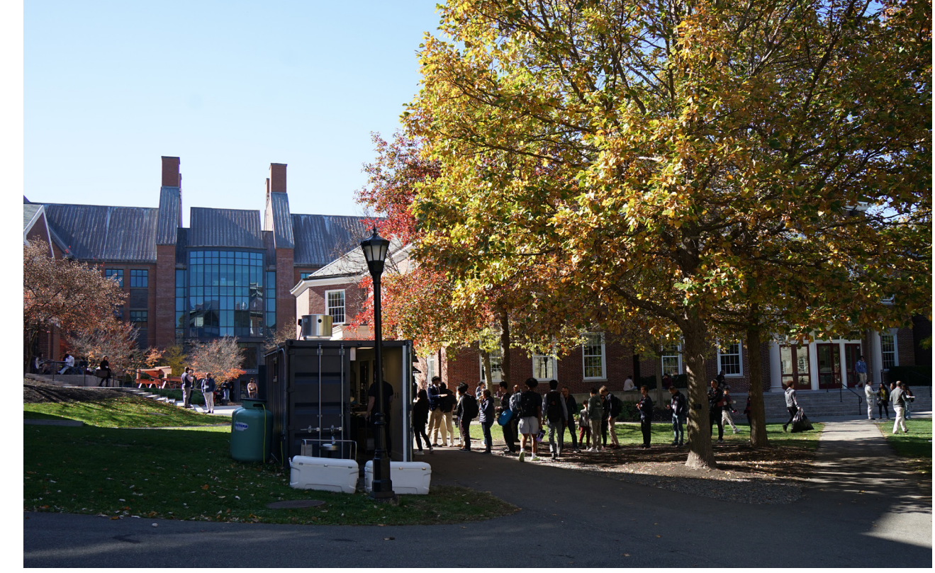
Students and families lining up at the pizza truck.

Instructor in English Emily Quirk agreed. "I think, in a boarding FAMILY WEEKEND, 2