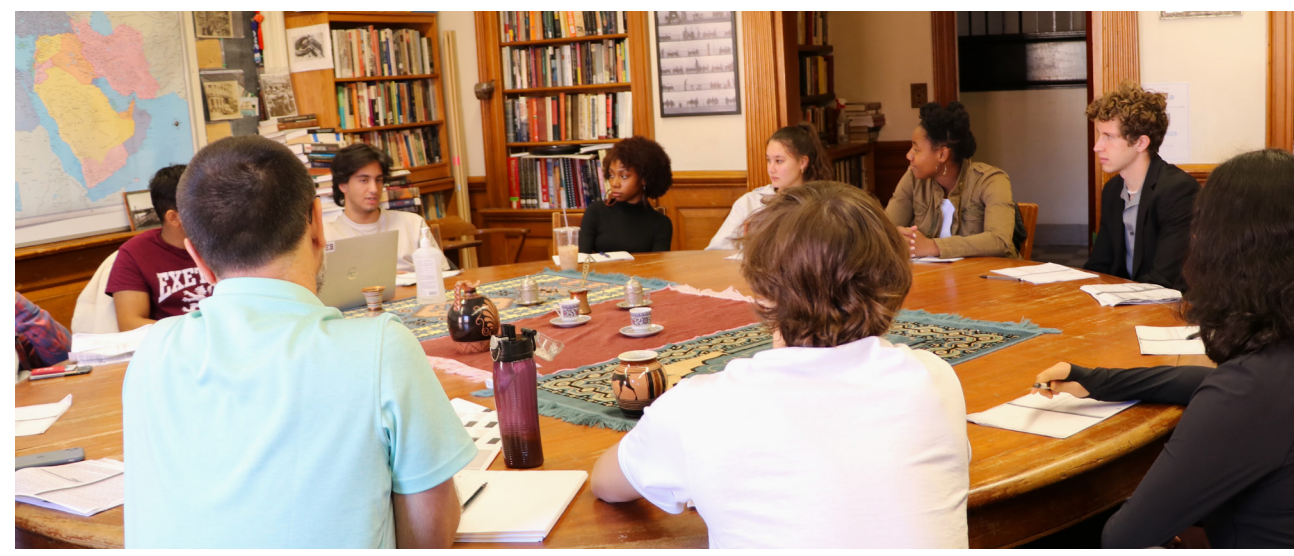
Students sit around a history Harkness table.