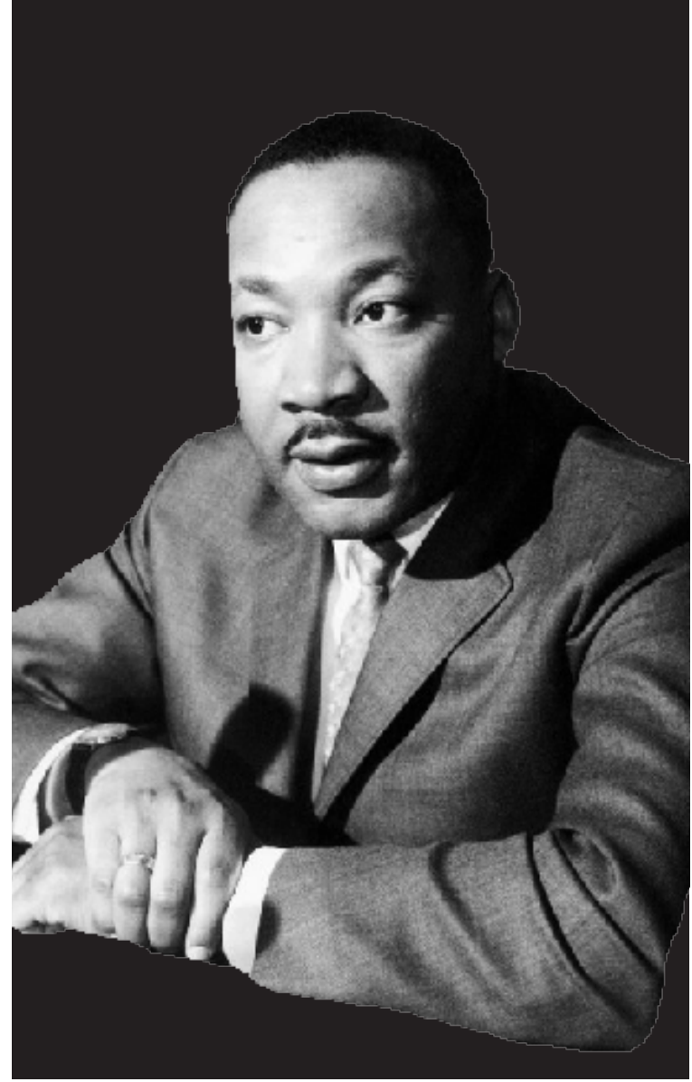
Exeter honors King.

by the workshops that day." Students hope that MLK