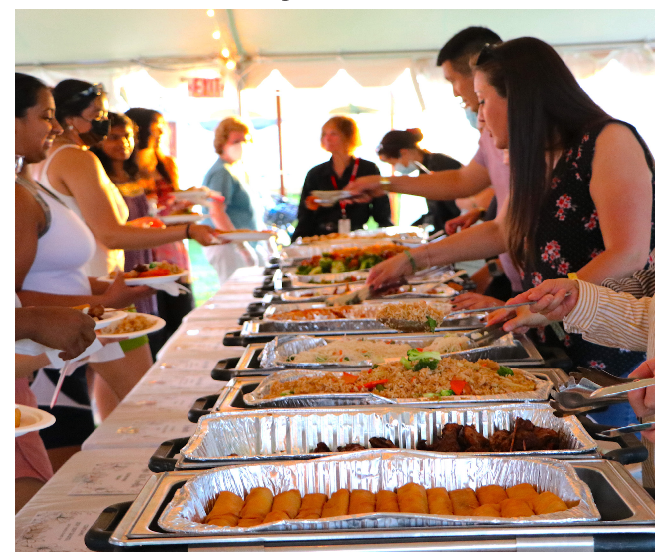
AAPI, 5 AAPI faculty help serve the food at Asian Dinner.

The International Student Alliance, Exeter Pinoy Society, and Asian Voices hosted the Spring Soul Fest on April 30th. As students snacked on a variety of foods like boba, Asian snacks, and empanadas, others were performing at the Academic Quad, with open-mic and karaoke performances.