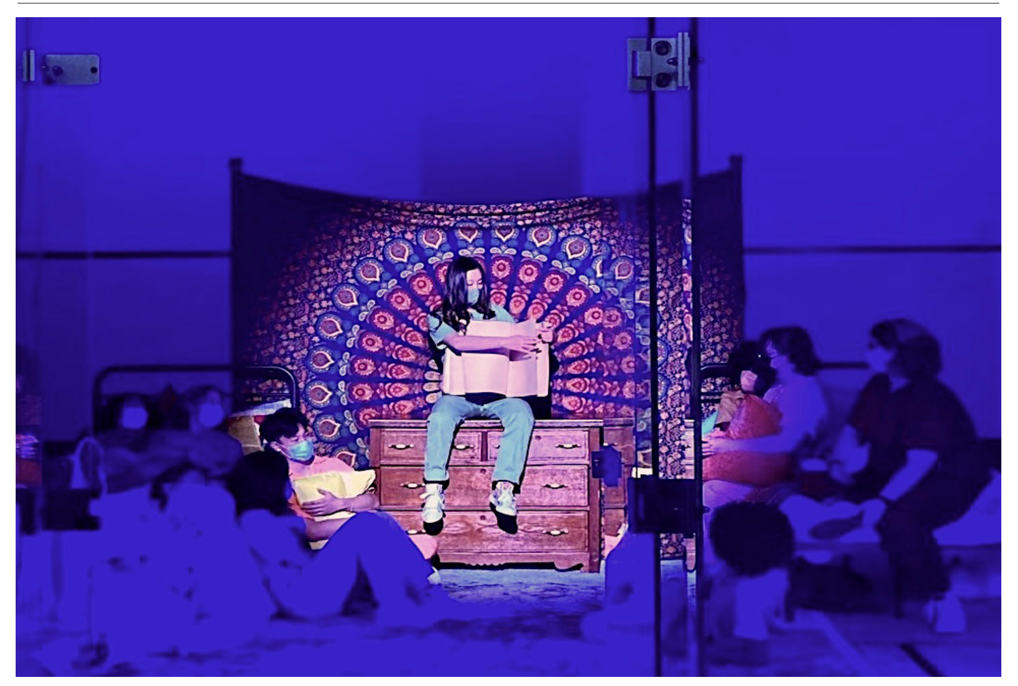
The cast of "Open The Gate" at a rehearsal on the squash courts.